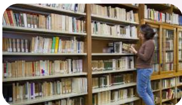
The University Library contains over 14,000 titles.