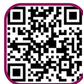
Video of a few students from the university.

I highly encourage the students who wish to study here to be spontaneous, ask for help when they need it and meet new people. You have to be well organized with your classes and your schedule before you arrive there.