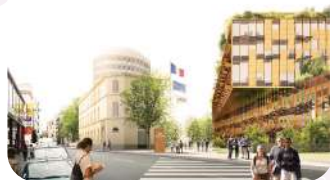
The Nation-Picpus district is urban and dynamic, and surrounded by Haussmanian buildings.