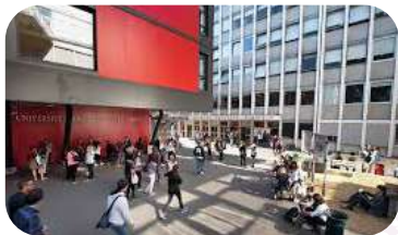
The University was founded in 1971, from the former University of Paris.