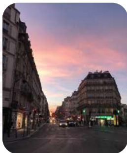
The Quarter Latin is the intellectual heart of Paris, it is located on the left bank of the river Seine.