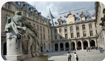
The Honor Court of La Sorbonne displays historical statues.